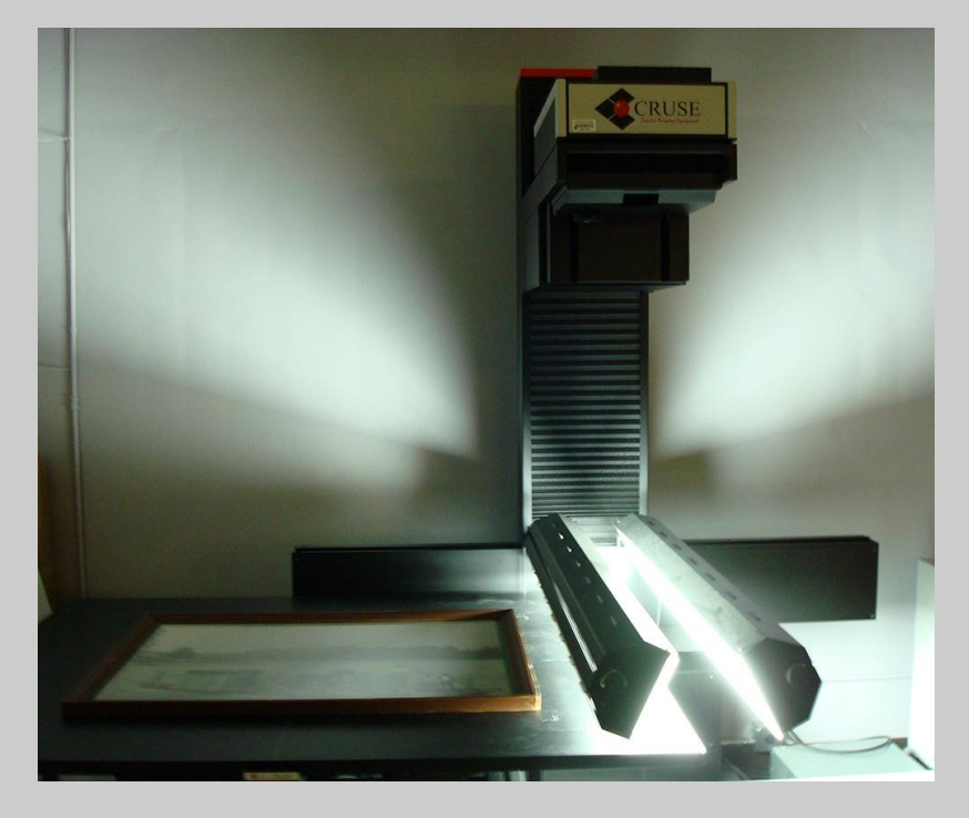
Cruse scanner at Washington State Archives.

*Many modern flatbed scanners meet these specs and are affordable!